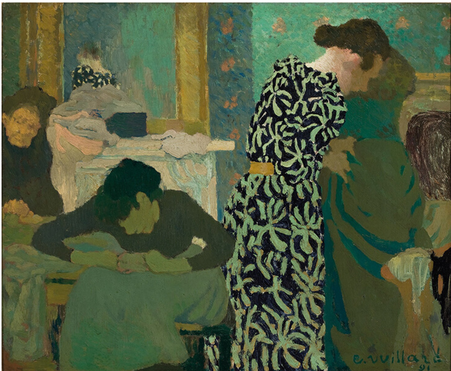
The Flowered Dress, 1891